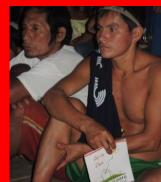
Cayetano: “Now we don’t look for oil more to lighting up”